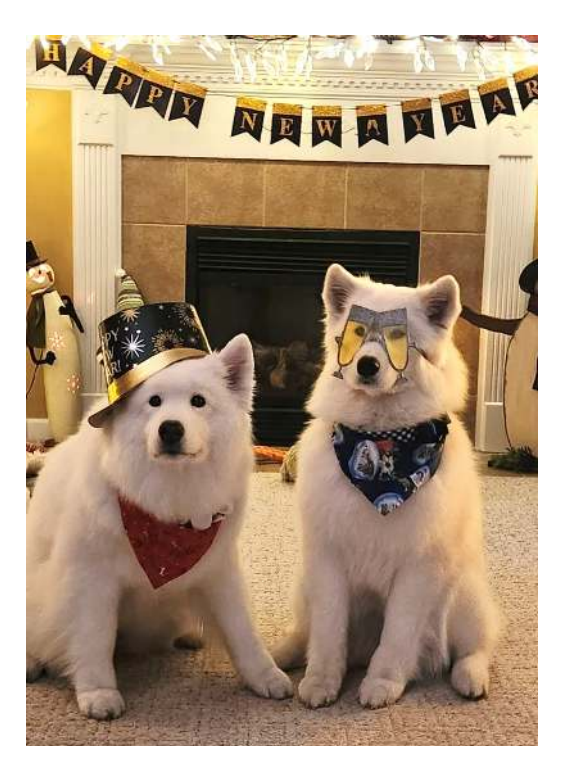
Happy 2024 from our office mascots Chara and Halley!

If you have any questions about your loans or just want to confirm you are in the right payment plan, please get in touch with us.