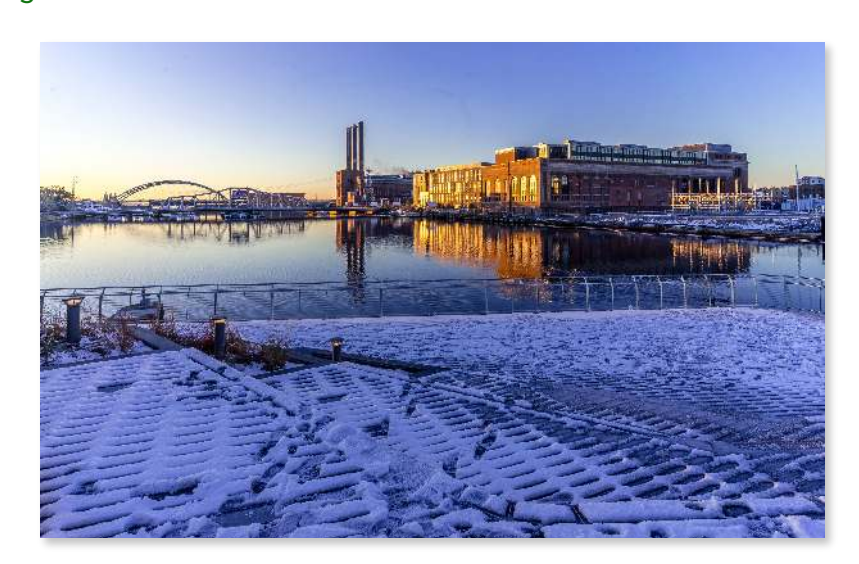
Providence River in Winter

Major changes to the Massachusetts estate tax and capital gains tax were signed into law in late 2023. Among other things, the new law increases the Massachusetts estate tax exclusion amount from $1 million to $2 million. Learn more at <a href="https://www.mass.gov/info-details/faqs-new-estate-tax-changes">https://www.mass.gov/info-details/faqs-new-estate-tax-changes</a>.